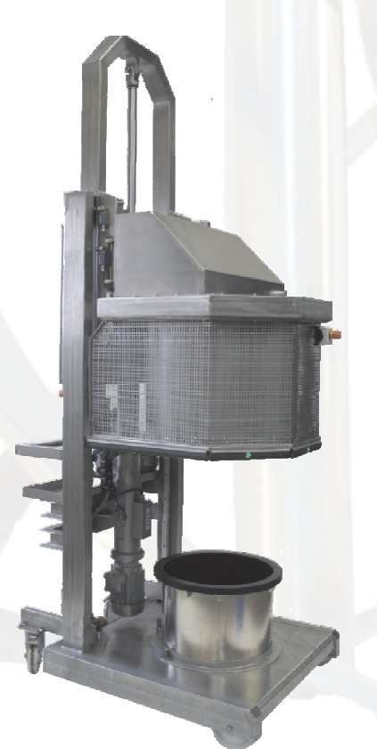
B 30 vacuum mixer mixing head lifted up