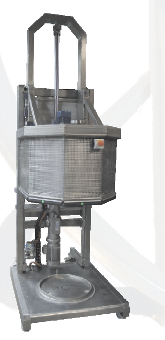
B 30 vacuum mixer mixing head lifted up