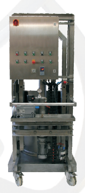
B 30 vacuum mixer back view