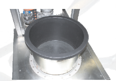
Container in stainless steel, teflon coats